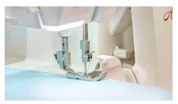
Pure Lighting with 3 LED Lights Clearly see every stitch, fabric and thread color under three bright LED lights.

Set the Acclaim to the type of stitch you want and get started! The Acclaim delivers a balanced stitch on any fabric with any type of thread.