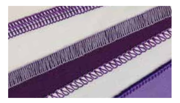
4/3/2 Thread Serging Finish projects with quality and versatility - easily switch from 4, 3 or 2 thread rolled hemming options.

Full-Featured Single Unit Differential Feed We've taken the differential feed to a new level by adding a single-unit feed dog mechanism. This ensures stronger feeding as well as consistent gathering on all fabrics.