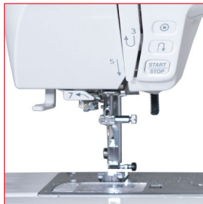
Superior Needle Threader with Thread Guide 7