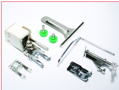
Quilting Set Included