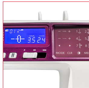
Easy Navigation and LCD Screen