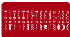
30 Built-in Stitches

The Janome Travel Mate 30 computerized sewing machine will have you in no time sewing like a professional, with its 30 built-in stitches, jam-proof top drop-in bobbin, and easy to read LCD display. By the screen, you'll find great convenience buttons for easy sewing including a locking stitch button, easy reverse button, and needle up/down button. Easily control your sewing speed by using the foot control.