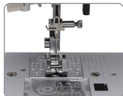
4-Piece Feed Dog