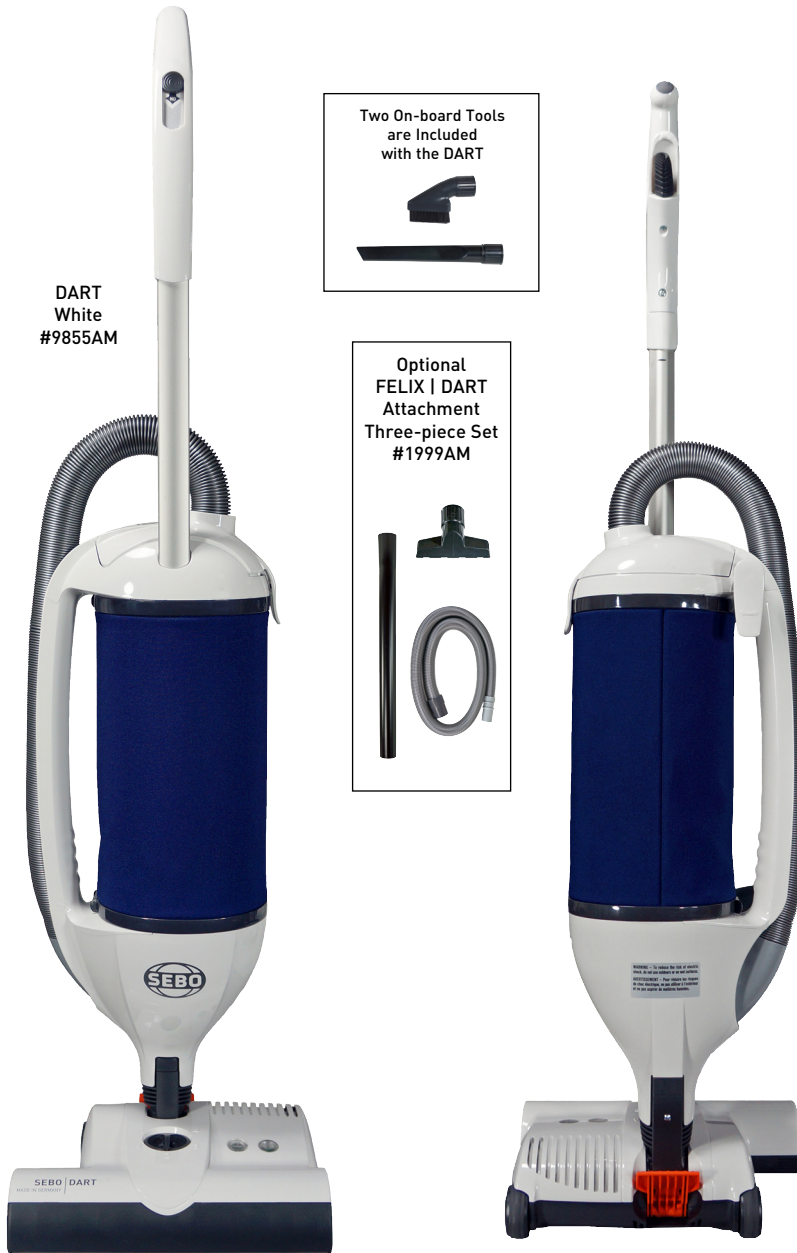
DART White #9855AM

The stylish, ultra-quiet DART offers all the flexibility of a canister vacuum cleaner in an upright configuration! It has a convenient instant-use cleaning hose, excellent filtration, a detachable suction unit that becomes a powerful hand-held vacuum, plus two on-board attachments. Many optional attachments are also available. It features the 12-inch-wide ET-1 power head, with four-level manual height adjustment, that cleans both carpets and hard floors, easily removes pet hair, and the extension side of its L-shaped contour makes cleaning under counters easy! In addition, its spinning brush roller can be shut off to clean delicate rugs and hard floors with straight suction. It also includes tool-free brush roller removal, a light that illuminates when brush height is set too high, the bristles are excessively worn, or when automatic shut off occurs due to brush-roller obstructions.