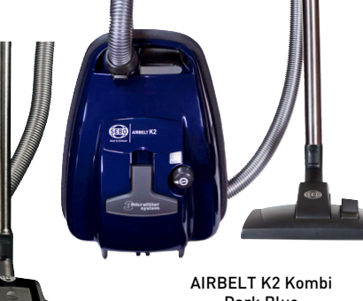
AIRBELT K2 Kombi Dark Blue with Combination Nozzle #9679AM