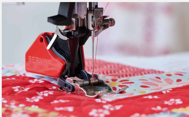
Special Edition Red BERNINA Walking Foot #50 included

The B 735 PE comes with the exclusive BERNINA Walking Foot #50 in matching red as well as the Patchwork Foot #37. In addition, a beautiful Special Edition dust cover is included as part of the standard accessories.