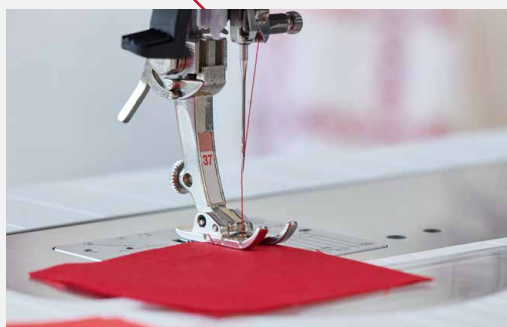
Patchwork Foot #37 included

Speed control Sewing and embroidery speeds up to 1,000 stitches per minute