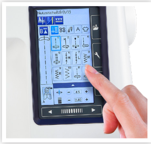
TOUCH SCREEN WITH 13 LANGUAGES