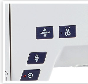
AUTOMATIC PRESSER FOOT LIFT