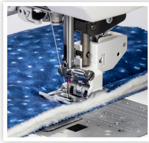
ACUFEED FLEX FABRIC FEEDING SYSTEM