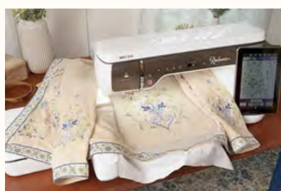
11 5/8" x 18 1/4" embroidery hoop