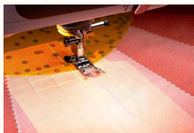
Precise sewing placement with projected guidelines

SEWING MACHINES SAVE STORES VACUUM CLEANERS