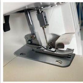
EIGHT PIECE FEED DOG FOR IMPROVED FEEDING

Offering Improved Stability, Power, and Feeding Ability