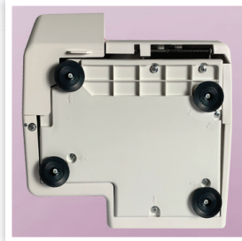
HANENITE RUBBERFEET REDUCE VIBRATION

Introducing the MyLock 454D from Janome's new SAILING LINE of sergers. This compact and user-friendly machine delivers professional-level sewing performance. Equipped with an enhanced feed system, including an 8-piece feed dog, a newly designed presser foot, unobstructed view of the cutting knife, and improved bi-level performance, it can tackle a wide range of projects and fabrics. Threading is simplified with the Easy Threading Looper and slide-in pre-tensions. The improved motor torque and specialized Hanenite Rubber feet, designed to reduce vibration and noise, provide a Smooth Sailing sewing experience.